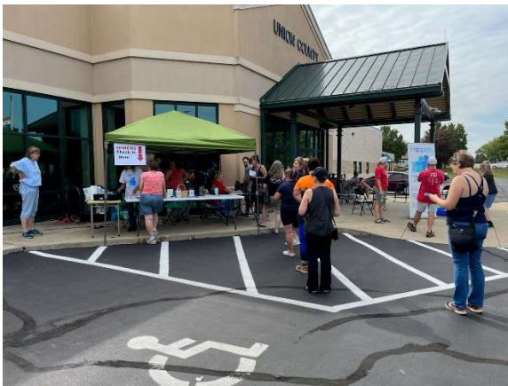
Hospets Pet Vaccination Clinic 6/26/2022 and 9/18/2022